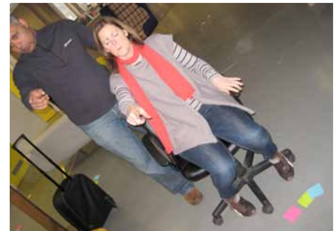
04 There are markers/lines on the floor to lead them around the market.