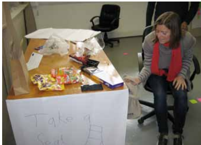
09 They find the lockers and leave their bags...