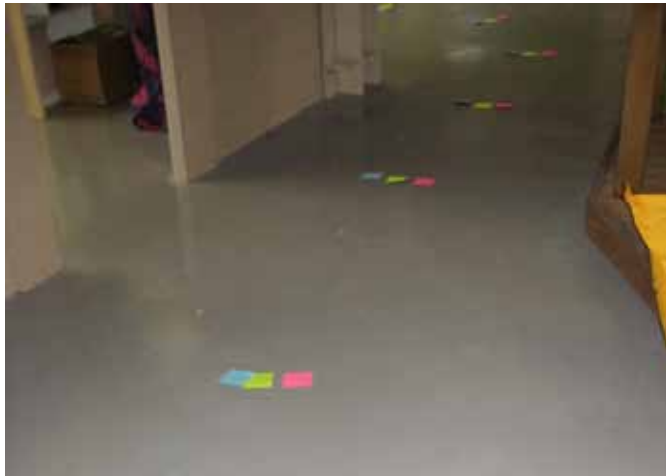
05 They follow the line/markers