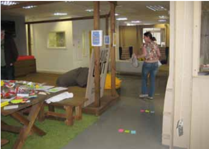
14 The thief makes a swift get away.