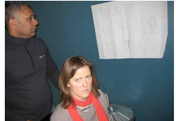
07 They find the toilets and think they'd like to stop for a coffee...