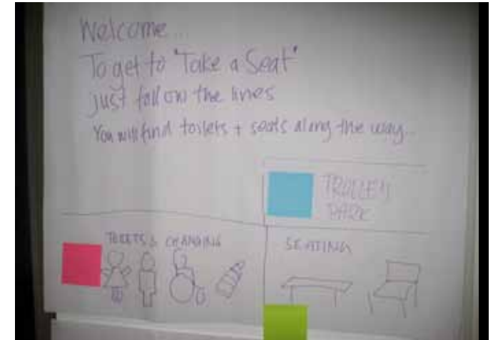
02 Take a Seat offers: Trolley Park/Bag Safe, Toilets and Seating