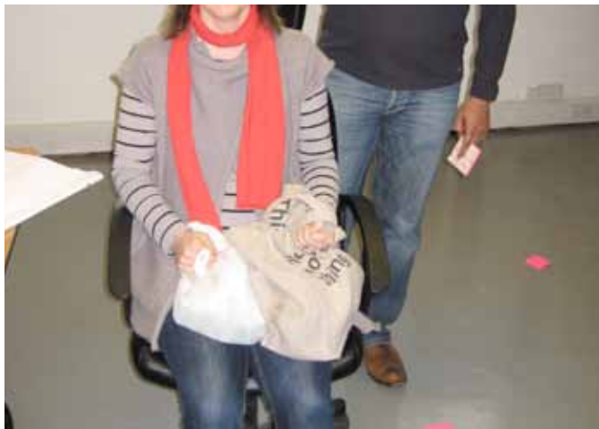
08 ...but they have too many bags.