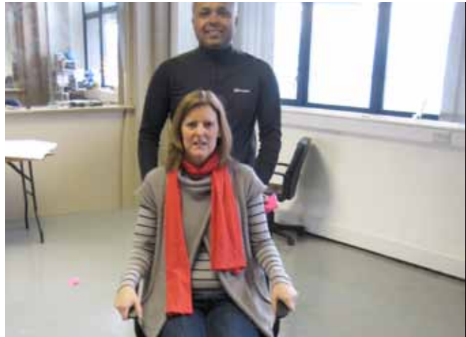
06 They feel happy they know where they are going...