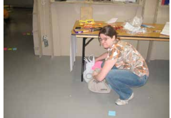
13 The security cameras spot the bags being stolen.